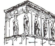
ΣΥΝΔΕΣΜΟΣ ΤΩΝ ΑΠΑΝΤΑΧΟΥ ΚΑΡΥΑΤΩΝ

The Karyates Association welcomes this effort and hope that other Brotherhoods around the world will soon follow.